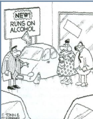
"What a coincidence - so does he!"

Thank you for celebrating your recovery with us!