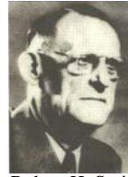
Robert H. Smith (Dr. Bob)

This we owe to A.A.’s future: To place our common welfare first; To keep our fellowship united; For on A.A. unity depend our lives; And the lives of those to come.