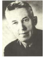
William G. Wilson (Bill W.)